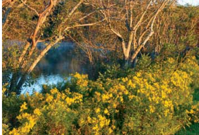
Autumn view of Lake Canonchet and goldenrod.

Visitors and members will enjoy learning about the area on our popular guided walks, led by experts in the fields of nature, culture, and the sciences. With 1.5 miles of walking trails and proximity to the South County Museum, Canonchet Farm is a perfect venue for a day's outing.