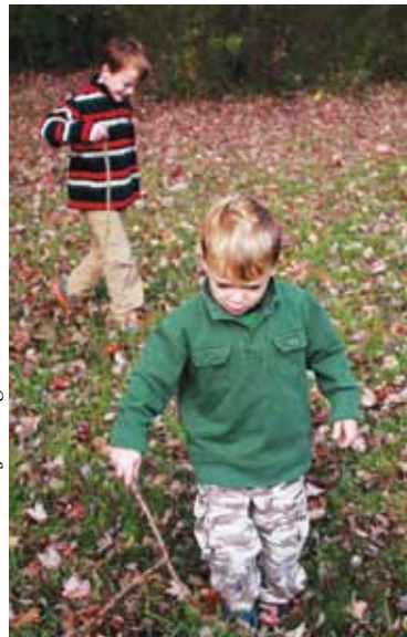
Children find a lot to discover in the fields and along the trails.

Today Canonchet Farm is a green space unlike any other in Rhode Island. Comprised of 175 acres of fresh and saltwater wetlands, forests, brooks, and ponds abutting Pettaquamscutt Cove on Narrow River, the land is habitat for a wide variety of birds, plants, animals, and insects. The John H. Chaffee National Wildlife Refuge owns ten acres of the land, while the remaining 165 acres belong to the Town of Narragansett. The original open fields of farmland have, over the years, grown into a thick forest of native and invasive plants and trees.